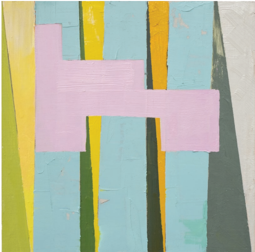
There's Also Room for Breaking Out of Living (JA) , 2019 Oil, graphite on vintage found canvas mounted on panel 12 x 12 in