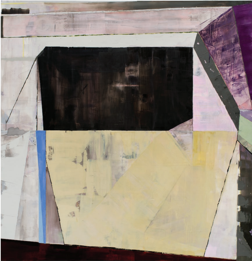
The Inexperienced Miracle Worker , 2015 Oil, paper, plaster, chalk on birch panel 65 x 62 in