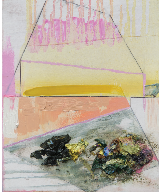
As Is, So There (5), 2014–15 Oil, graphite on birch panel 12½ x 10 in

Ross is now generating studies for a series she is calling “unreliable structures,” acrylic, oil, pastel chalk, graphite, and fabric on Arches oil paper. In “Study 4,” layers of ethereal, sprayed on color—pink, yellow, salmon, blue, green—create geometric suggestions of form. Lines appear and disappear. Shapes shift. The forms, Ross told me, “do not add up to a clear space or a clear perspective.” Looking at them, it is not clear whether the structures are “struggling to shore themselves up” or are “actually coming apart.” When she is making them, Ross feels like the forms might fall on her, but she also senses that she might be able to grab onto some section of the image and pull herself up. “How do you fix it?” Ross asked me. “How do you repair what can't be resolved?”