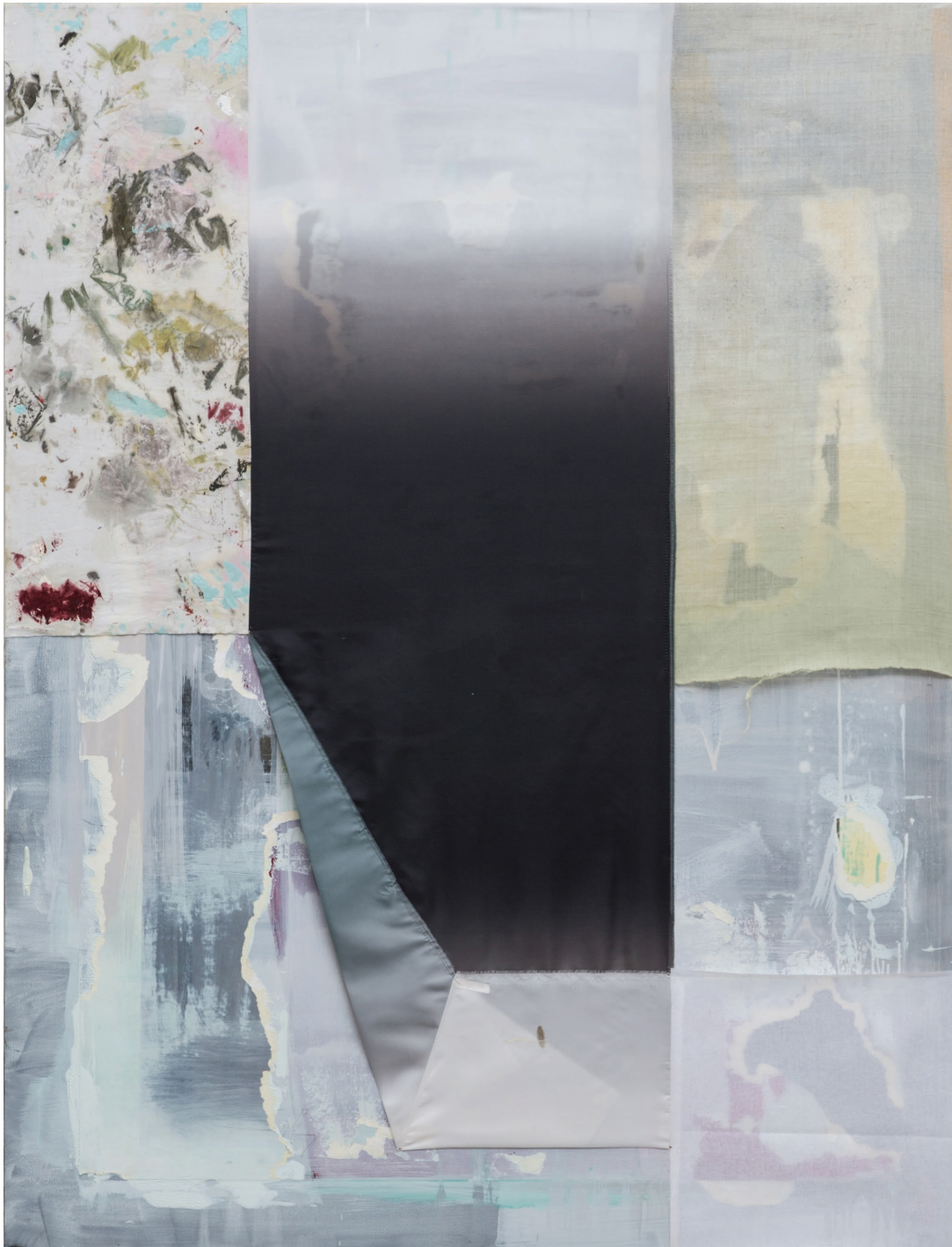
Redress: With a composure periodically fractured by wailing (for D.R.) , 2016 Cotton, polyester, crinoline, hemp linen, spray paint, oil paint, digital print, graphite 56 x 43 in