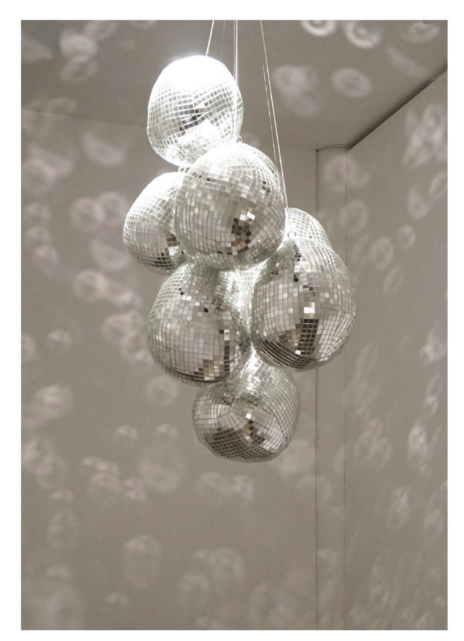
Endless Night (disco lumps), 2017 Mirror, Styrofoam, cable, disco ball motor, beanbag chair Dimensions variable

Crotch Pipe , 2019 Welded steel 90 x 15 x 24 in