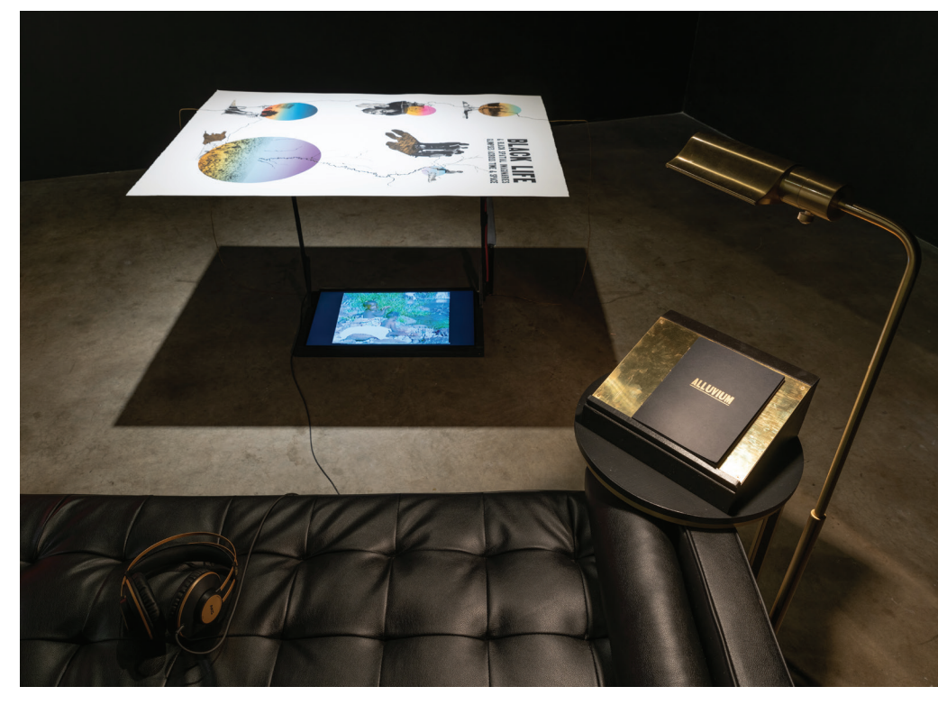
Black Life, Black Spatial Imaginaries: Glimpses Across Time and Space, A Visual Bibliography, 2018–2019 Installation view Dimensions variable Research and concept with Lisa K. Bates Printed with Watershed Center for Fine Art Publishing and Research